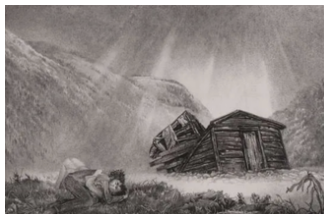
Story Clove, Catskill Mountains ©Norma Morgan

Open throughout the weekend with 5 summer shows on view, a standout is: "Norma Morgan: In the Lands of the Moors and Catskills," the first solo exhibition of the celebrated-yet-overlooked African-American woman's contribution to Woodstock's Colony of the Arts.